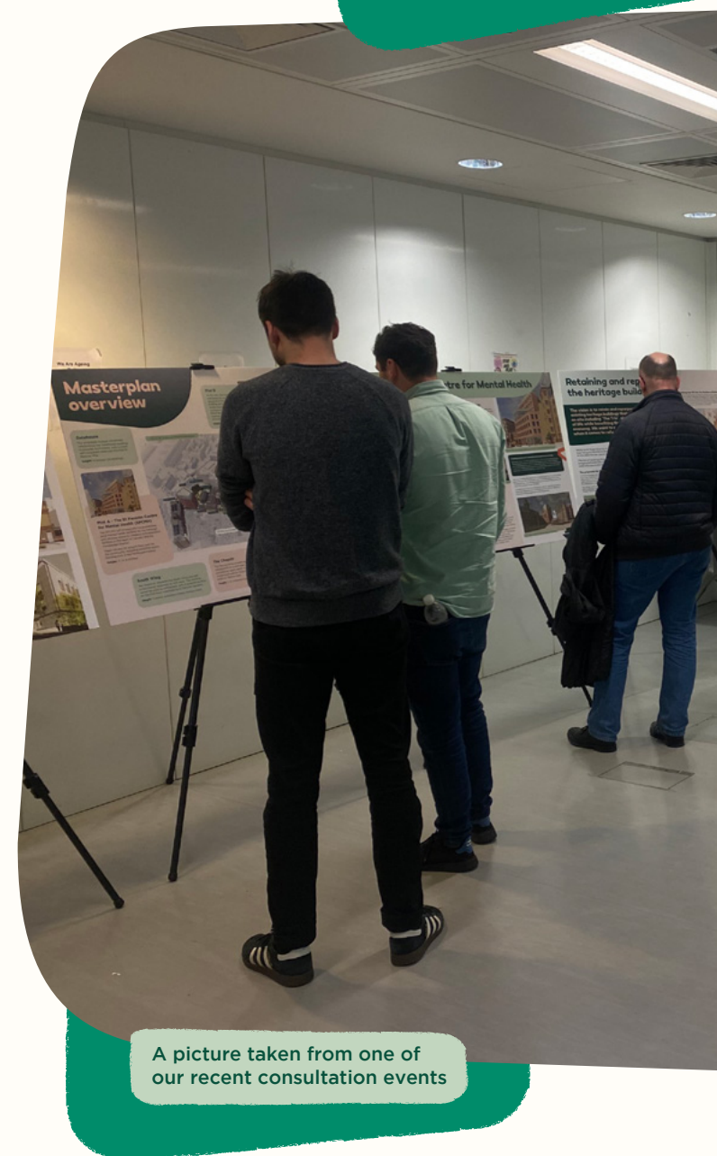
A picture taken from one of our recent consultation events

Requests to open up the site further , ensuring that the connection to St Pancras Gardens and Regent's Canal is enhanced, allowing people to move freely through the landscaped spaces.